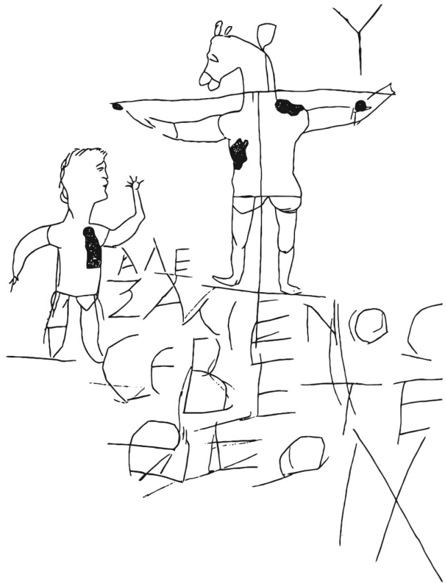
Tracing of the graffito carved in the plaster