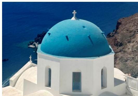
Greek church in Oia.

If we did not know the meaning that the Greeks give to this word, we would need to do no more than to look at any Greek church, and we would see on the top of the building, outside, a cross , not a stake!